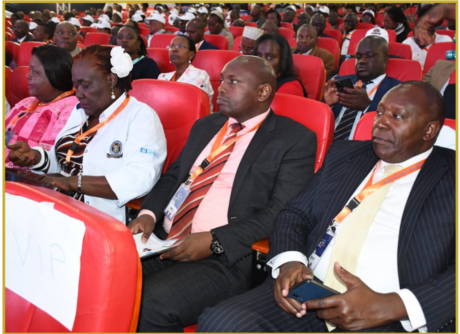
A section of teachers at the World Teachers' Day celebrations last year. President Ruto has promised to employ intern teachers on permanent and pensionable terms of service.

The changes include dissolving of 47 State corporations with duplicated and overlapping functions, scrapping of confidential budget in various executive offices, and suspension of purchase of new vehicles by government for 12 months.